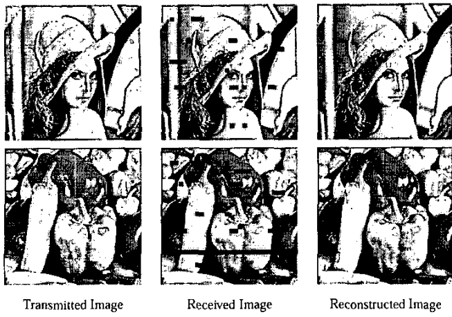
Fig. 1. Reconstruction results for 1,2 or 3 contiguous lost blocks (first row) or more drastic losses (second row).

sented here, to color data needs to be investigated. Since the missing blocks in the different channels need not be in the same image position, information from different channels can be used in the block classification and reconstruction. Adding this to the current neighboring information used is expected to improve even further the quality of the results. A preliminary example is presented in Fig 3. Further results on this will be reported elsewhere.